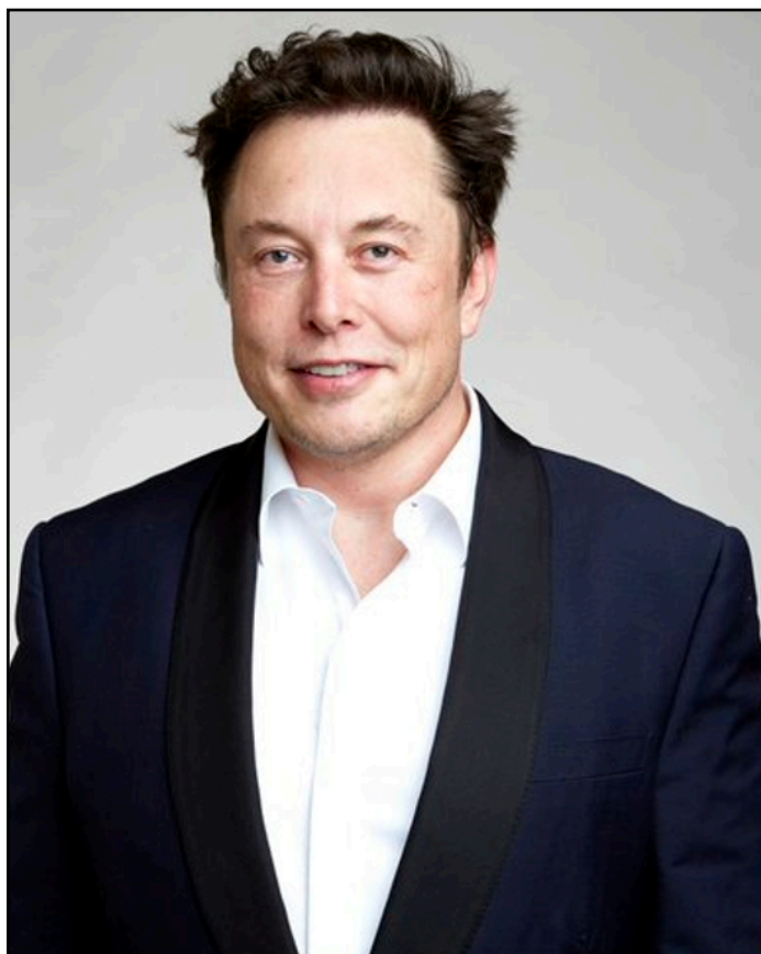
The owner of Augusta Nationals