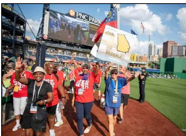
Georgia Athletes in the National Senior Games Parade of Athletes!

The Georgia Golden Olympics is funded by registrations and donations from friends and organizations who care about the health and well being of older adults.