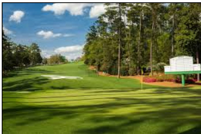
Masters played at Augusta National