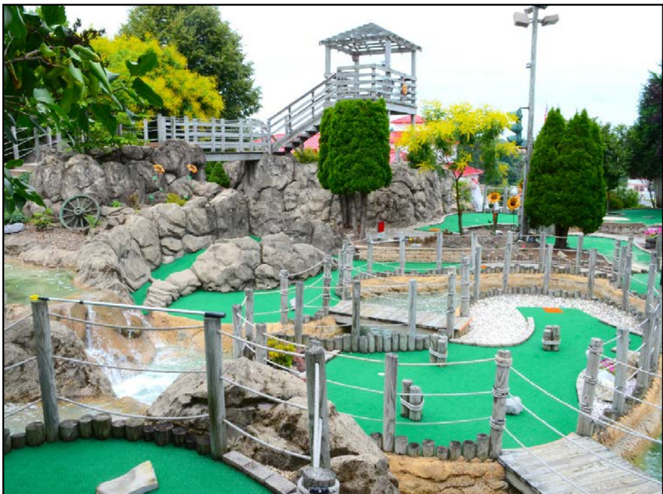
Mini-golf at Jekyll Island

If you are special enough to become a member of this elite golf club and able to pay big bucks, you may attend the tournament, or part of it, during this azalea blooming month. Or, if you want to economize, you can watch it on CBS and ESPN at your favorite sports bar, restaurant, or, of course, at home.