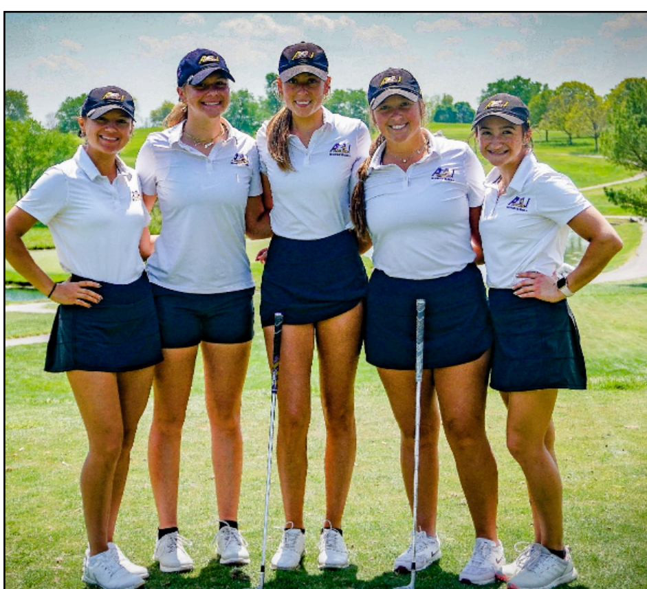
Women are great golfers