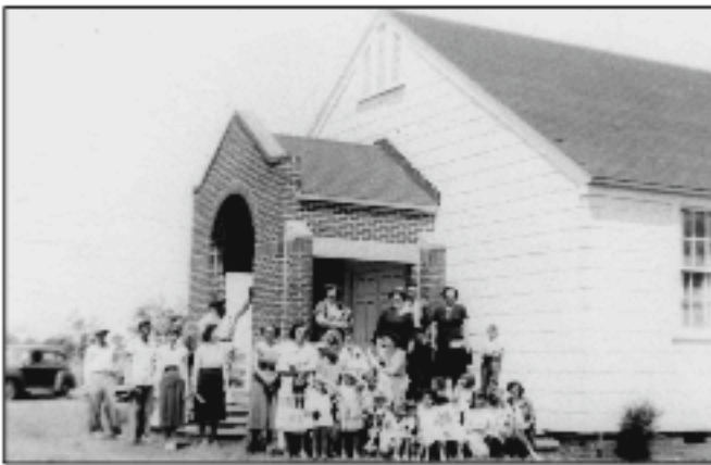
Old Hebron Church in Zenith, Georgia.

Romans 15:13: "May the God of Hope fill you with all joy and peace in believing, so that by the power of the Holy Spirit you may abound in Hope."