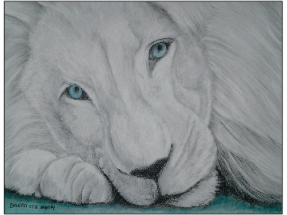
Blueyed Lion in colored pencil.