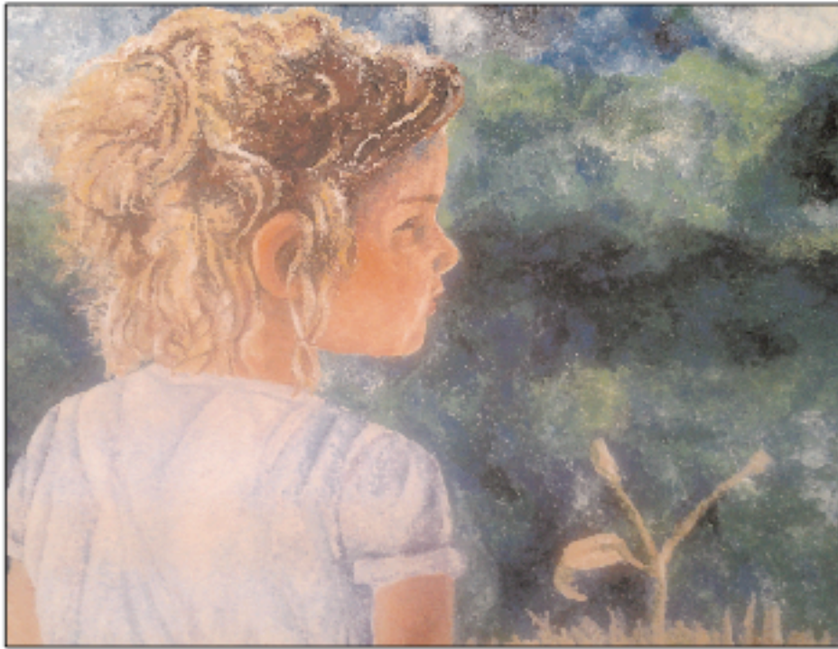
Painting done with cotton swabs.