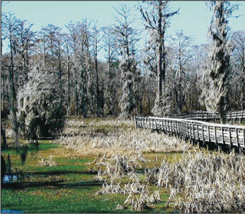
Overlooking the river

Also starting on April 1, for the 1st Saturday of every month, at 9:30 am, there is a pleasant nature walk at Phinizy Swamp. The volunteers of the Academy lead an hour hike through the park which is for anyone and everyone to enjoy. What a great time for us to spend with our grandkids! The hikes are leisurely-paced walks through wetlands, over picturesque trails and scenic outlooks. "Each volunteer leading the hike speaks about the