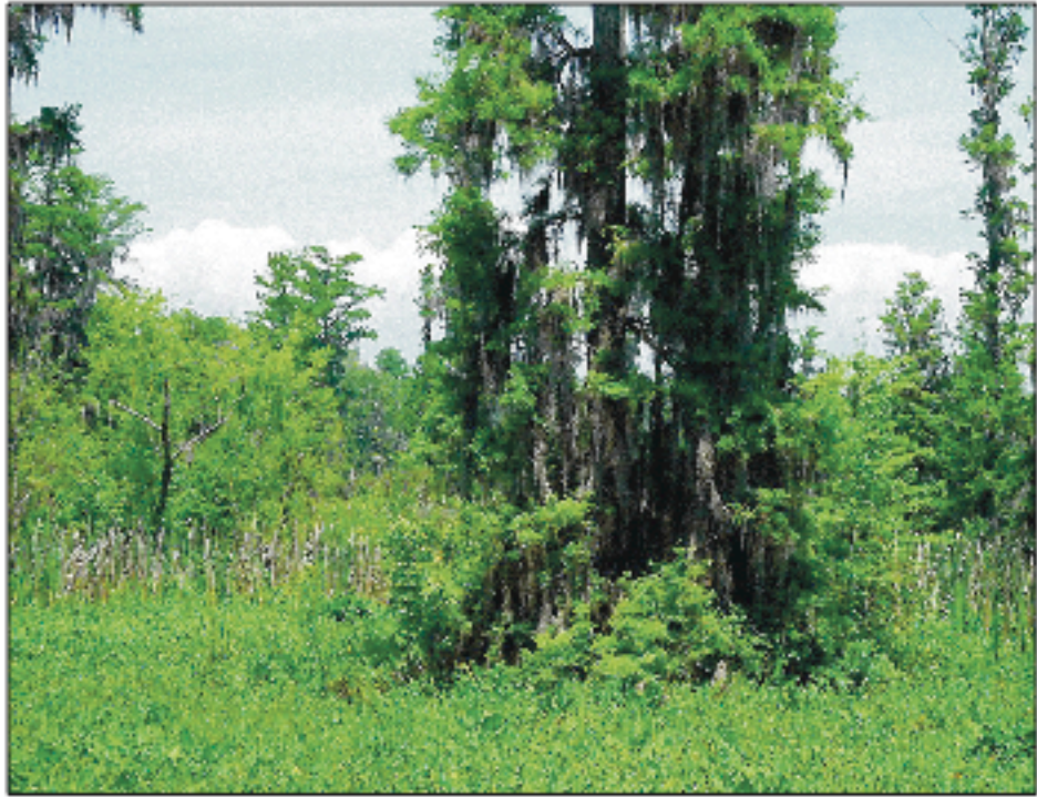
Gorgeous trees surround the area

events. Contact the office at 706.828.2109 for more information. Phinizy Swamp is located at 1858 Lock and Dam Road, in Augusta, 30906.