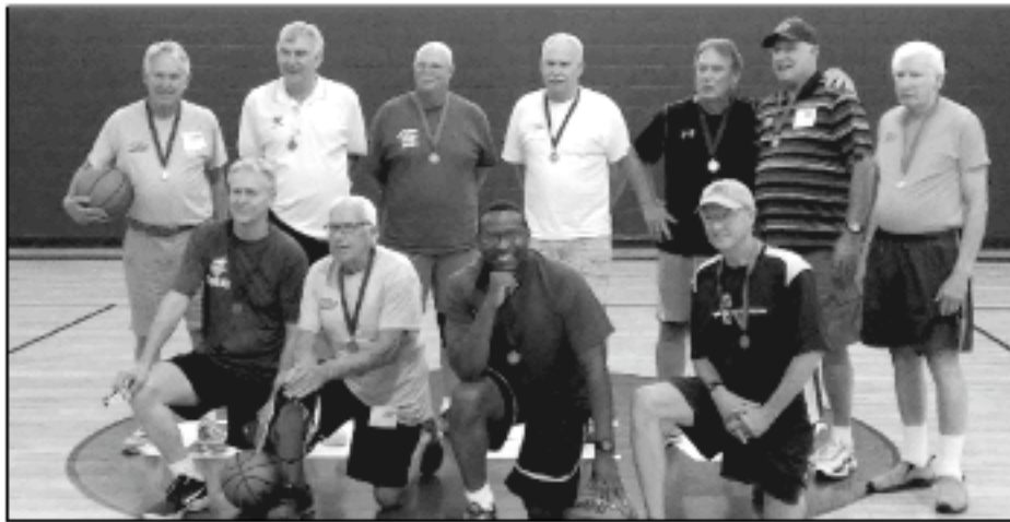
2015 Basketball Athletes

Please call (706) 722-8454 for more information or visit www.augustamuseum.org .