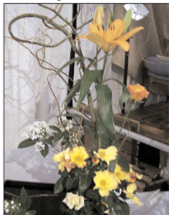
Intricate arrangement of floral design