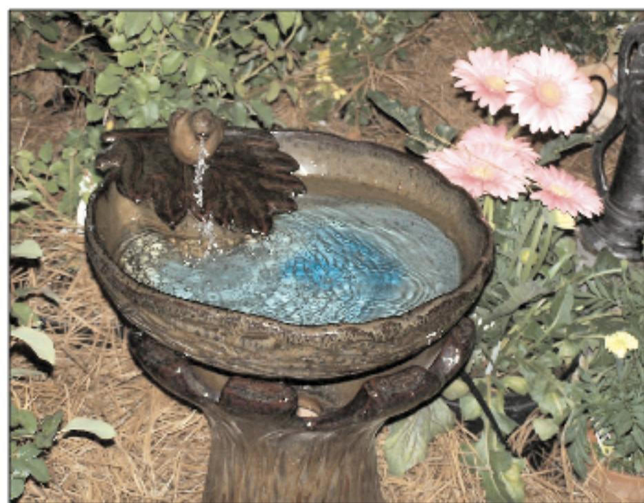
Beautiful floral exhibit

a new exhibit called Wish Upon A Butterfly which will feature butterflies, providing a great educational and entertaining experience. There will be butterfly experts on site to teach everything we wanted to know about these fascinating creatures.