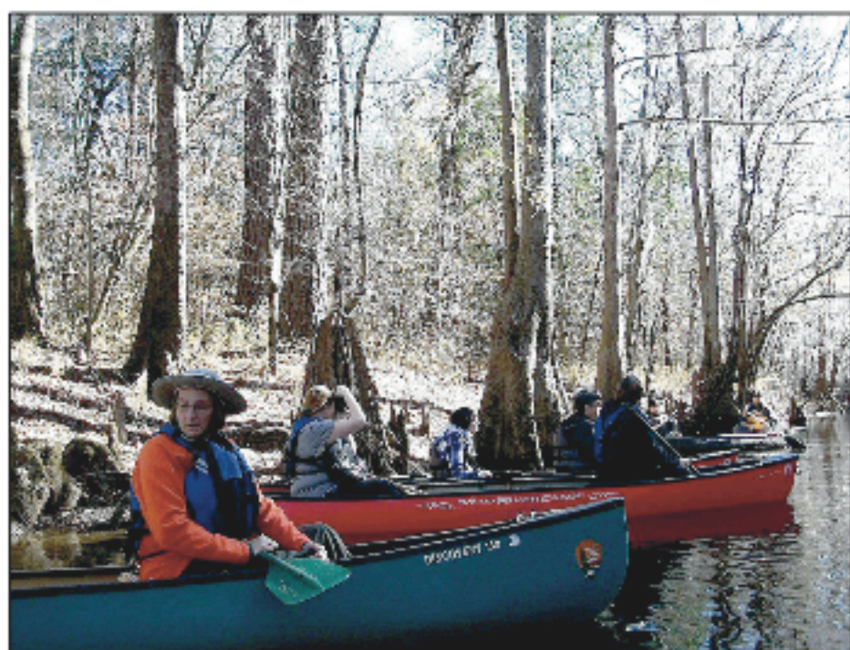
Canoeing up Cedar Creek

some interesting photos. So come to visit this great forest, take a walk or hike, sign up for a canoe ride, and enjoy the beautiful surroundings that nature provides. For more information, visit www.nps.gov/cong or call 803.776.4396 for more information.