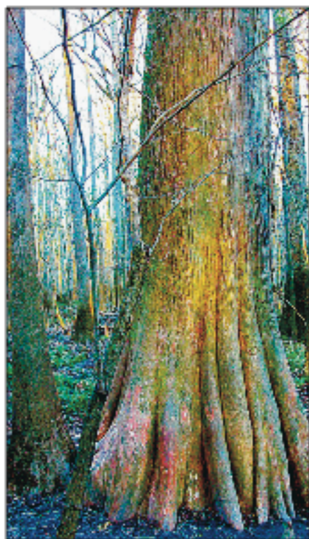
The knees of the cypress trees