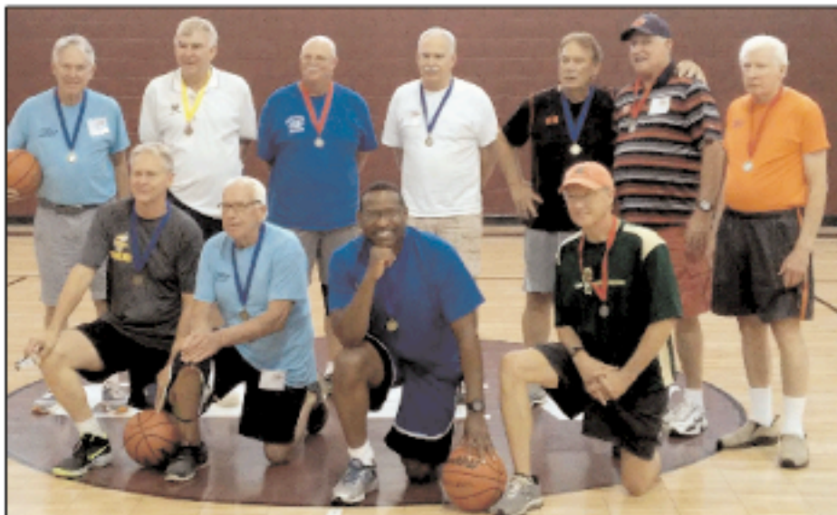
2015 Basketball Athletes