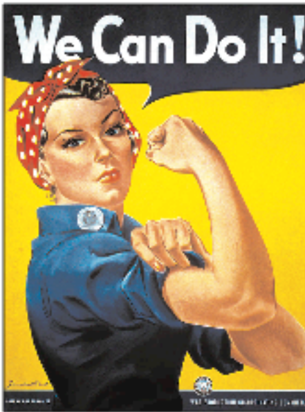
We Can Do It Poster