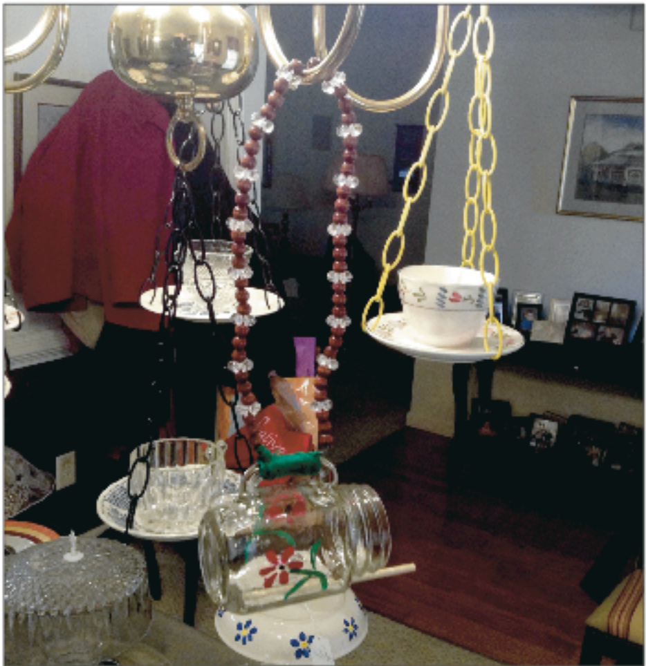
Wade creates a variety of yard ornaments with everything from bottles to beads.