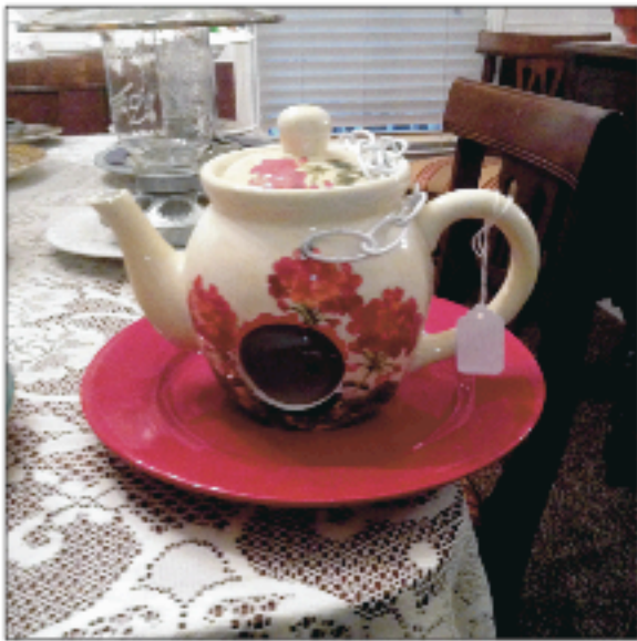
Old teapot makes ornamental bird feeder.

Wade has created custom feeders with family heirlooms and enjoys the challenge of working with those oddball pieces in the attic that neither have any practical use nor fit the décor. Like those old dishes Grandma saved from laundry soap boxes in the 50's. The ones the grandkids