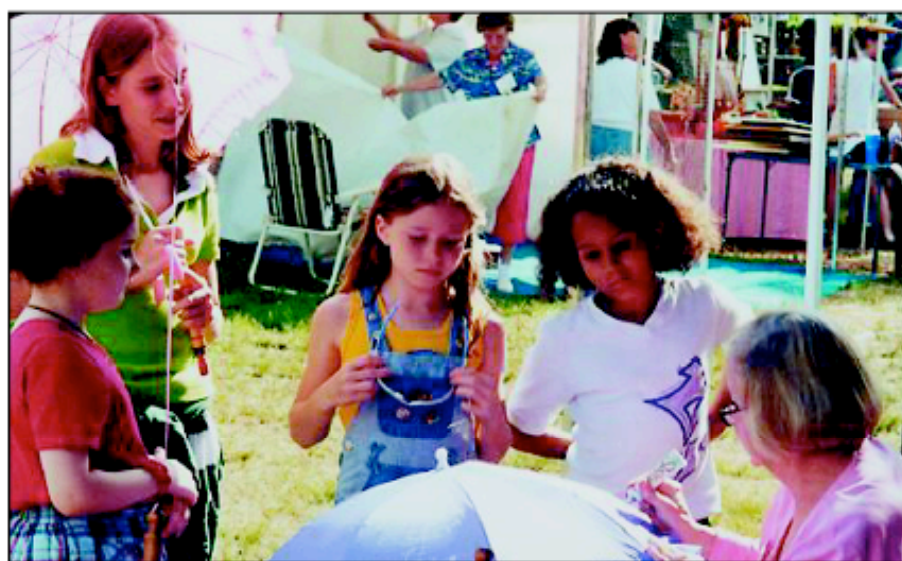
Umbrellas at the Cotton Pickin' Fair

Relax on a hay bale or a bench and enjoy musicians, folk dancers, lively marionettes, and amazing magic. Entertainers delight all ages