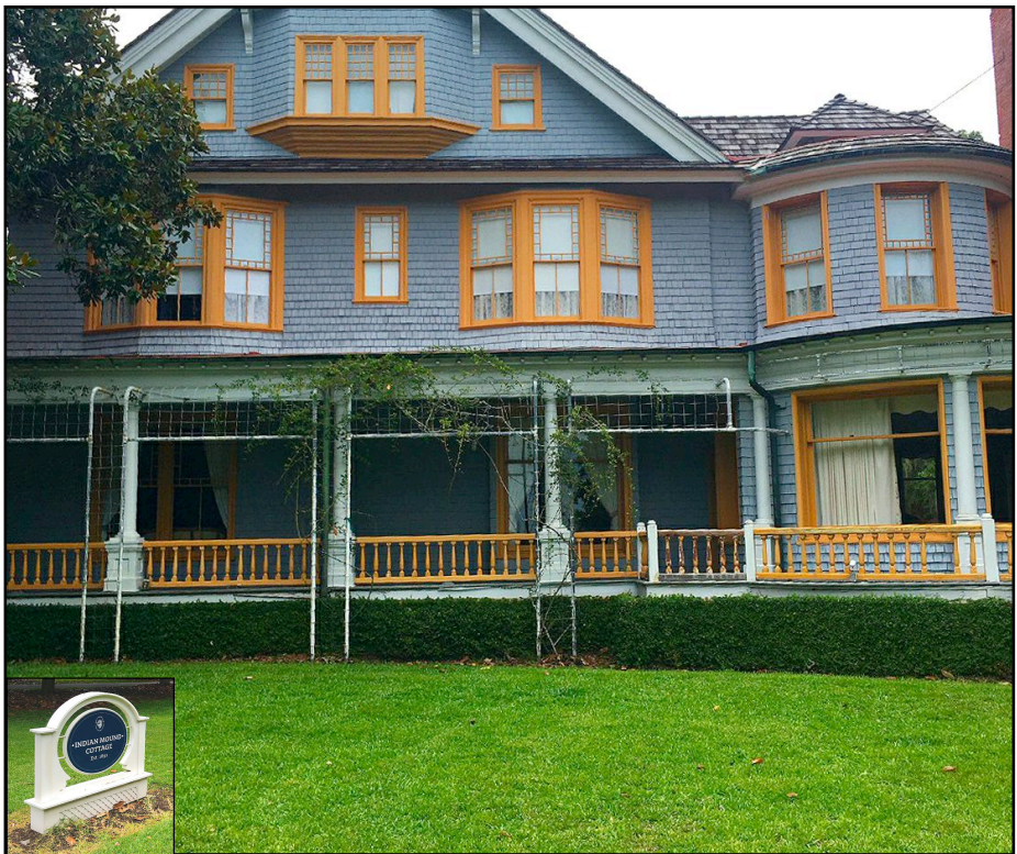
Beautiful Indian Mound Cottage