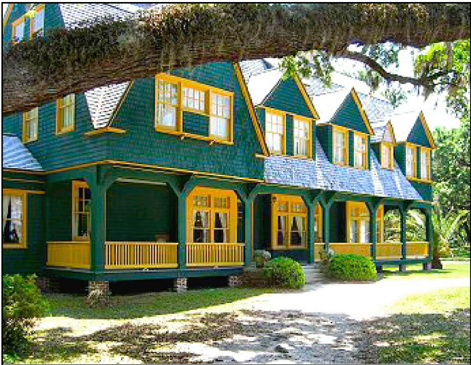
Moss Cottage with oak tree draped with Spanish moss