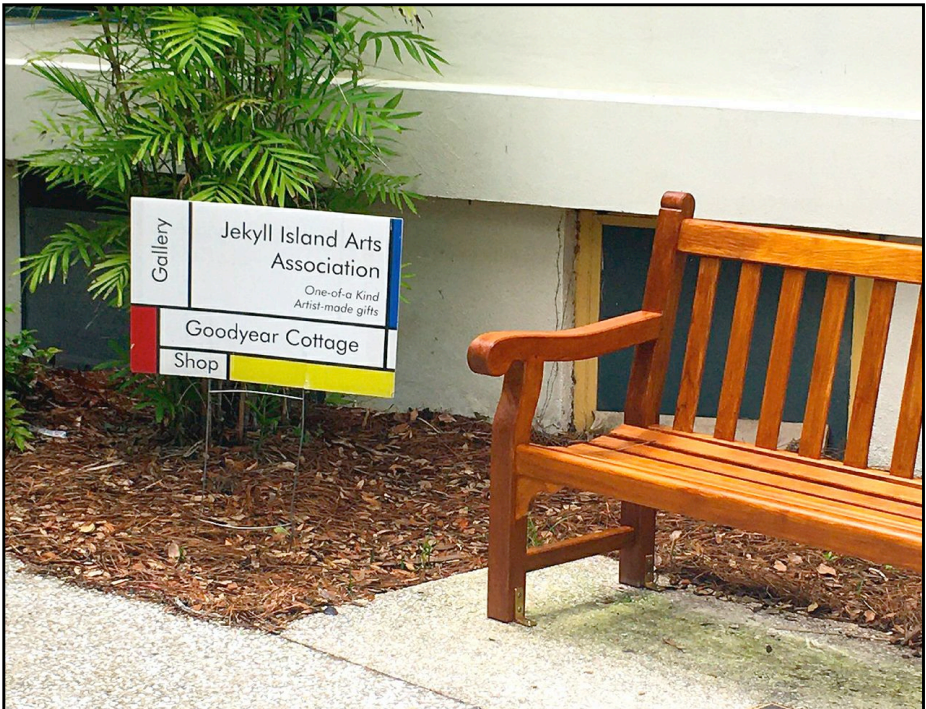
Goodyear Cottage entrance to the shop and gallery