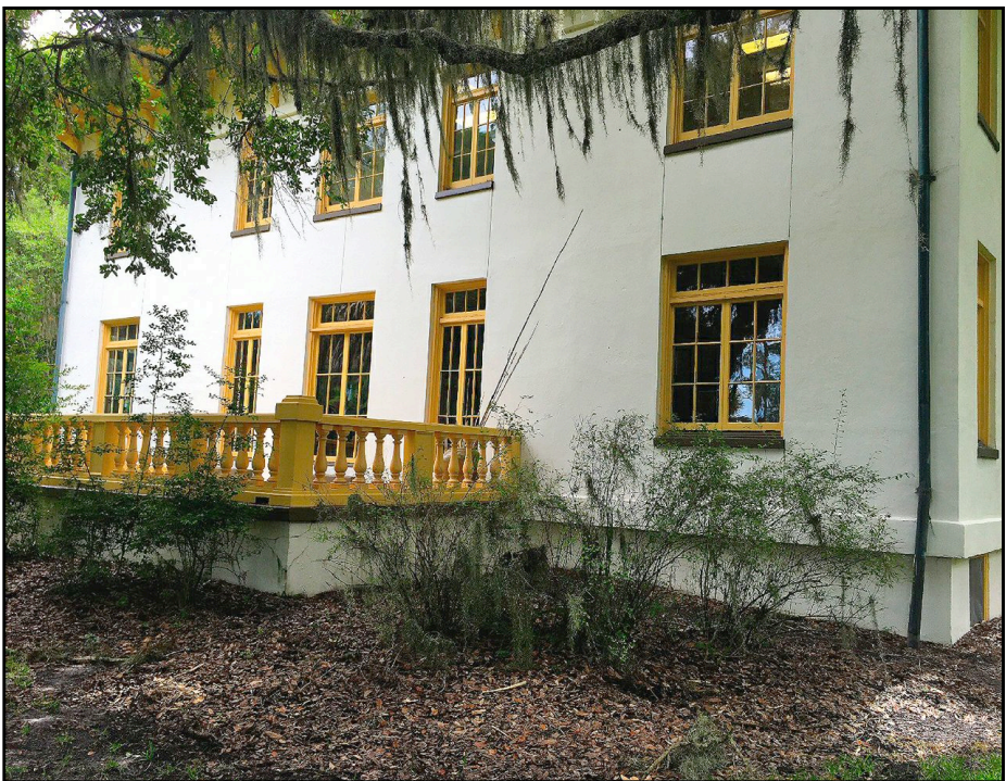
Goodyear Cottage side view