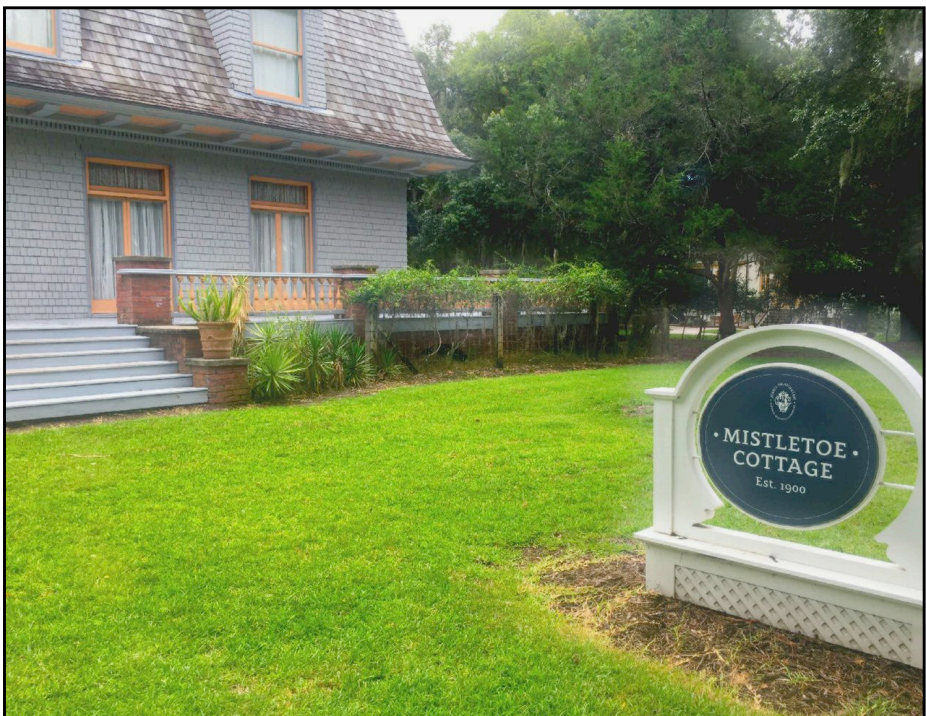
Mistletoe Cottage side view