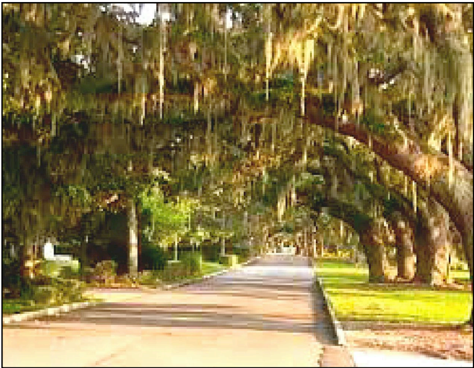
Walkway through the Historic District