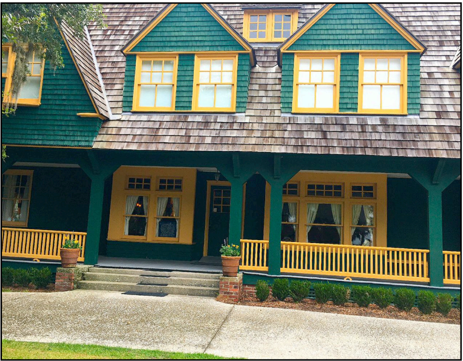
Popular Moss Cottage